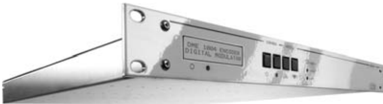
Fig. 3 – The 70MHz digital TV modulator for a microwave link, according to the DVB ETSI EN 300 421 standard, provided with multiplexers and MPEG-2 encoders (up to a maximum of 4) manufactured by ABE Elettronica S.p.A.

With reference to the above mentioned example of a 34Mbit/s (E3) telephone link, adding this error correction system (often necessary), the real bit rate capacity decreases from 30.720Mbit/s to 28.31Mbit/s.